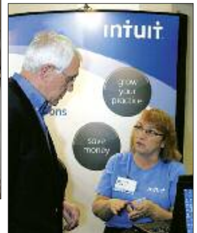
Computer-savvy accounting professionals want to see what's new and what's working for finance, business and accounting professionals.