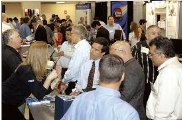
Person-to-person marketing provides the Show's exhibitors an opportunity to demonstrate and sell to a captive audience.

Over 1,000 accounting professionals will be there to see you.