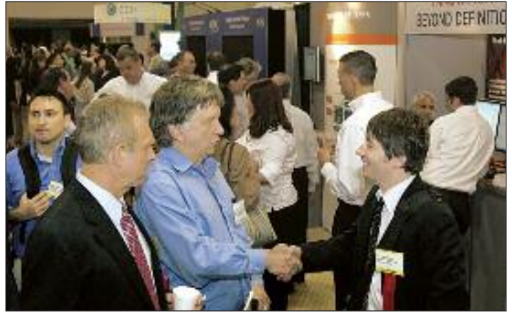
Crowds of attendees flooded the exhibit floor in 2010, establishing this as a major New York City marketplace for New Yorkers.

A COMPLETE PACKAGE OF SERVICES IS INCLUDED IN THE BOOTH RENTAL. Pre-Show services include free VIP invitations to invite your customers and prospects, listing in the Pre-Conference promotional brochure, Website and email promotions and Website listing. Crosslinking with your company's Website, free downloading of VIP email invitations to your customers and prospects. At-Show services include complete decoration services: curtain backwall, booth carpeting, side dividers, draped table, chairs, sign, waste basket, and free Show Directory listing. Post-Show services include Show attendee names and addresses in electronic file format.