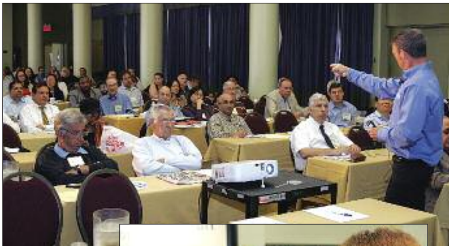
The CPE-accredited educational sessions were packed with accountants and their business clients eager to learn about new computer systems and financial products and services.

Flagg Management Inc 353 Lexington Ave, NY, NY 10016 212-286-0333 Fax: 212-286-0086 flaggmgmt@msn.com