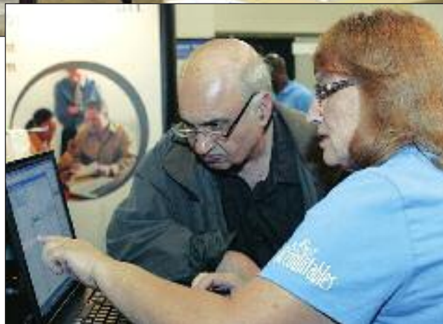
Tax preparation, accounting and business systems, Software-as-a-Service, and new Internet systems will be featured in the exhibits in 2011.