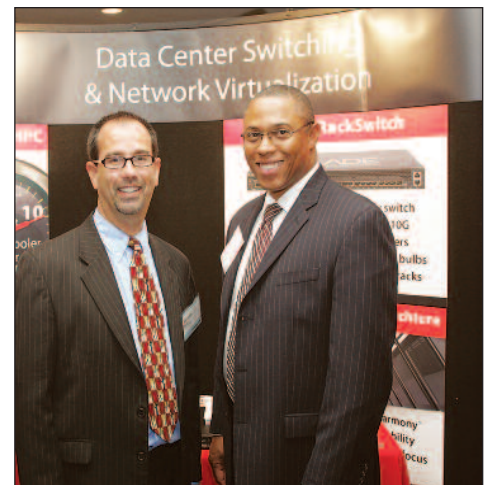
"Well organized show. We want to continue in this market next year."