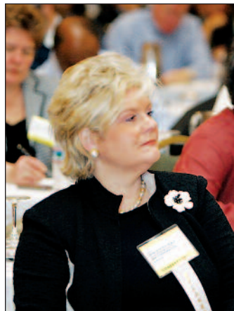
"The conference was an opportunity to hear from the top players in the HPC arena."