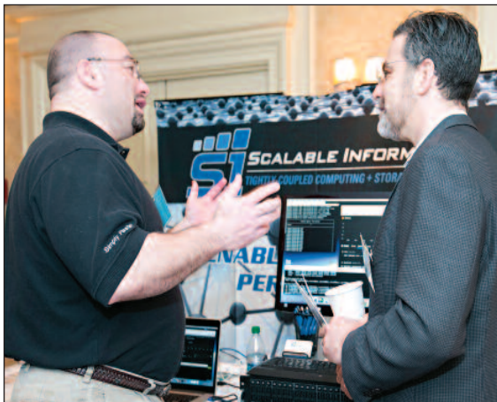
"We found the Show useful. Hold a space for us in 2016."