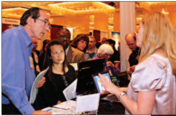
Network with your accounting and business colleagues at the largest meeting of CPAs in California this year.