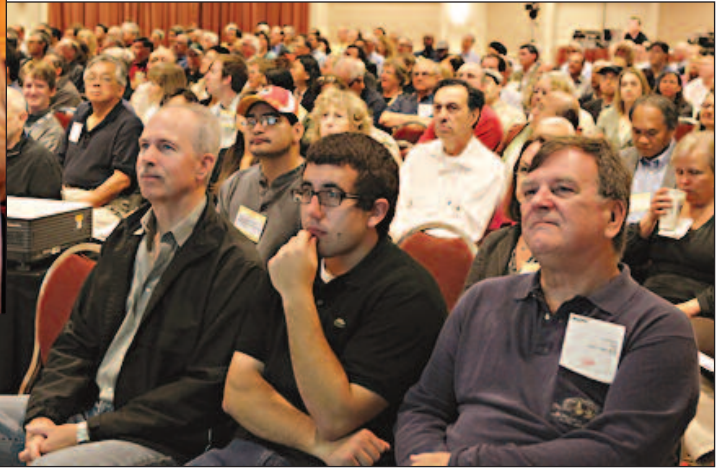
Attend the free opening sessions each day, 8:20-10 am with 2 hours of CPE credit.

The accounting marketplace is changing. See new technology, new financial services, new mobile devices, new Cloud, iPad, iPhone, new Apps, and more.