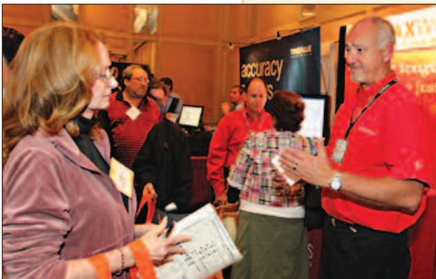
Hot new products and services on display at the Free Show.