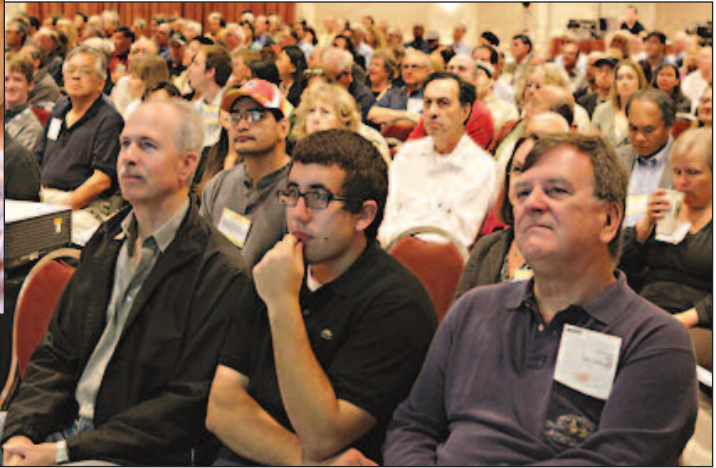
Attend the free opening sessions each day, 8:20-10 am with 2 hours of CPE credit.

The accounting marketplace is changing. See new technology, new financial services, new mobile devices, new Cloud, iPad, iPhone, new Apps, and more.