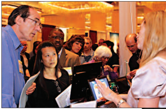
Network with your accounting and business colleagues at the largest meeting of CPAs in California this year.