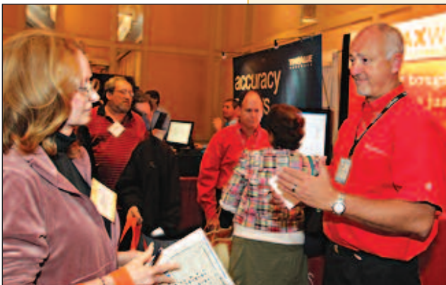
Hot new products and services on display at the Free Show.